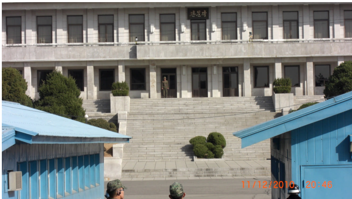
North Korean guard on duty (middle of photo) Blue buildings on the sides are where the negotiations took place.