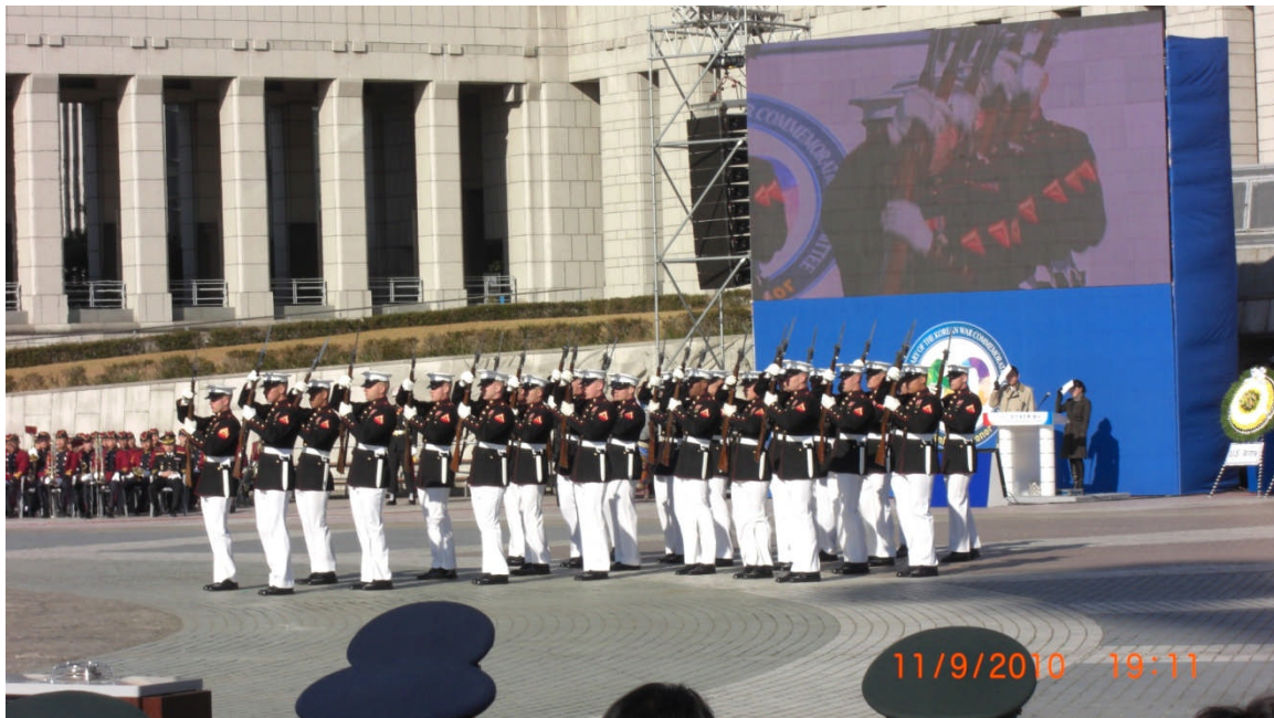
Marine presentation from the Korean War Anniversary trip.