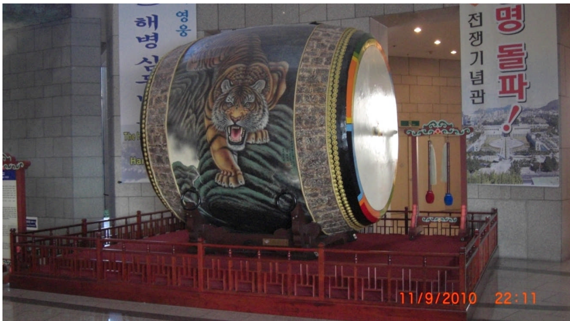
One of the many outstanding exhibits at the Korean War Anniversary tour.